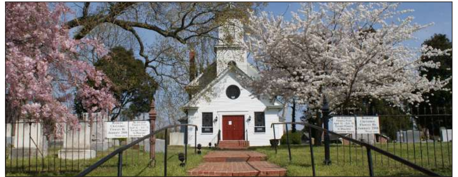
All Saints Church in Avenue