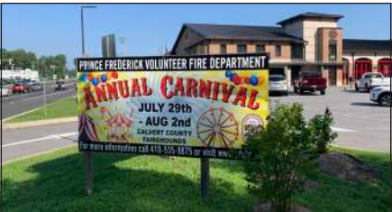
LOCAL 5 Prince Frederick Carnival in full swing