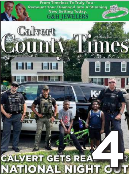
ON THE COVER 4 Calvert communities gear up for National Night Out