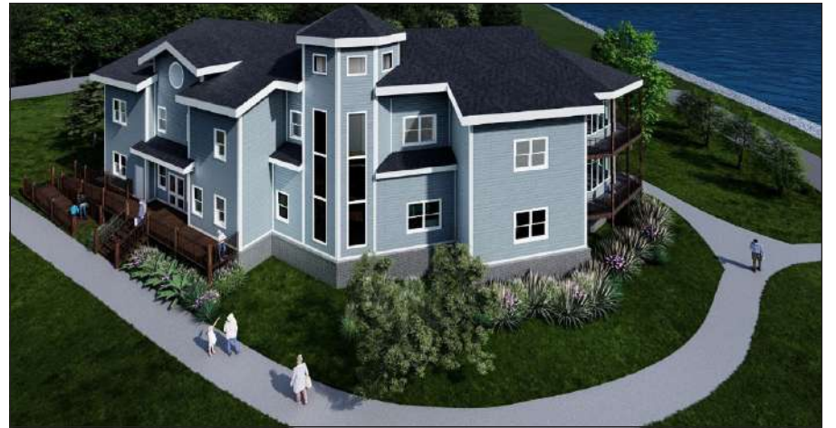
Artist's rendering of the new St. Clement's Island Museum

The Commissioners of St. Mary's County are pleased to announce the approval to award the St. Clement's Island Museum construction project contract to W.M. Davis, Inc., marking a significant milestone in preserving and enhancing one of Maryland's most treasured historical sites.