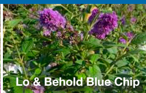
Lo & Behold Blue Chip