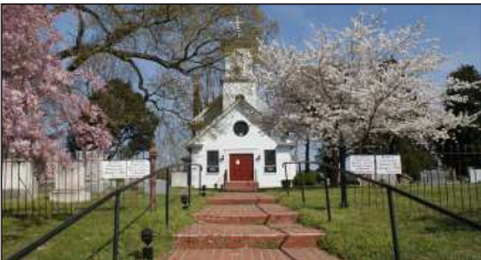
LOCAL 6 Proposal allows day-care in Critical Area