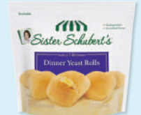
10 To 17-Oz., Cinnamon Rolls Or Selected Sister Schubert's Yeast Rolls

SALE PRICE 2/$4 DIGITAL COUPON 1.00 OFF TWO FINAL PRICE 2/$3