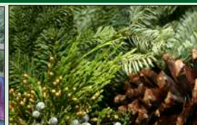
LIVE GREENS, SWAGS & ROPING