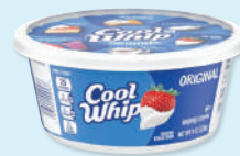
8-Oz., Selected Cool Whip Topping

SALE PRICE 2/$8 DIGITAL COUPON 1.00 OFF TWO FINAL PRICE 2/$7