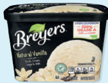
48-Oz., Selected Breyers Ice Cream

SALE PRICE 2/$8 DIGITAL COUPON 1.00 OFF TWO FINAL PRICE 2/$7