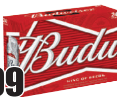
12-Oz. Cans 30-Pack Miller Lite