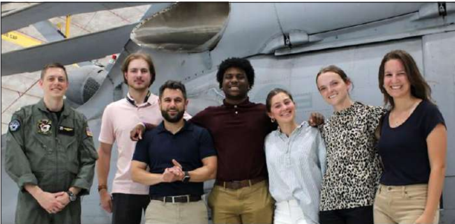
Students from NAVAIR SYSCOM Security Cooperation Office's Junior Personnel Development Program