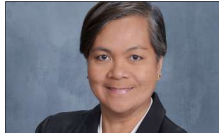
LOCAL 6 Calvert meets new health officer