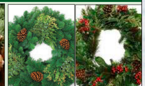
FRESH LIVE WREATHS