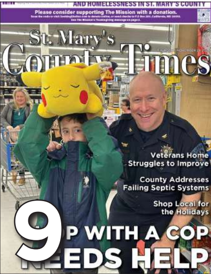
ON THE COVER Kids and cops program now in need