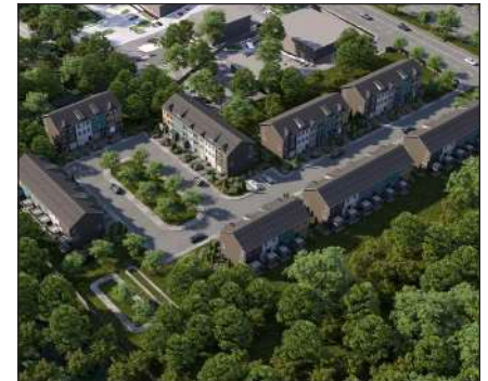
An artist's rendering of Riverside Townhomes

The traffic study reported this addition