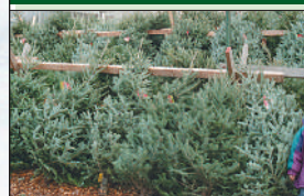
FRESH CUT CHRISTMAS TREES