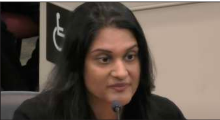
LOCAL 10 Commissioners look for septic solutions